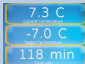
"Macro Details" screen allows easy visual check of parameters from a distance