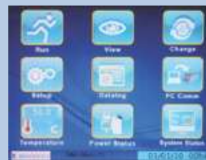
Intuitive graphic user interface

All program cycles are logged with a user-defined time-date stamp and a name (if desired) selected by the user through an on-screen interface. These details, along with precise time vs. temperature information for every program run, are loaded to an onboard SD card. At any time, this information can be retrieved by any PC or Mac computer using our included Crysalys CryoLink™ software. Computer operation allows for a larger screen and more detailed graphic information.