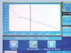
Visual interface of program in progress