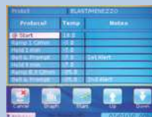
Full user-programmability eliminates need for any "chips" to change