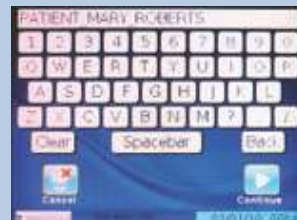
Onboard QWERTY keyboard for entering information