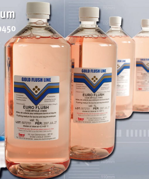
Euroflush Embryo Flushing Medium ref 019450