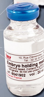
Embryo Holding and Shipping Medium (by 4 x 20 ml) ref 019449