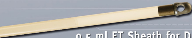
0.5 ml ET Sheath for D5-D8 Embryo Sterile - (Individually wrapped, by 10) ref 017532