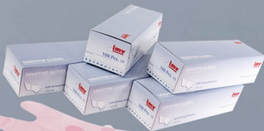
Red sensitive gloves Dispensing box - 100 gloves ref 021091