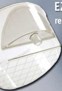
EZ Filter ref 017726