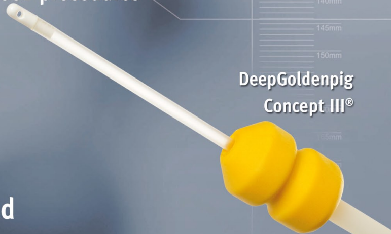
DeepGoldenpig Concept III®